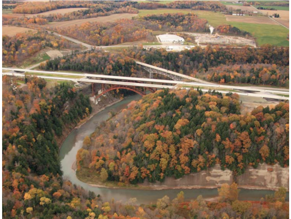
Award winning U.S. Route 219 twin arch bridges over Cattaraugus Creek located in Concord, Erie County, and Ashford, Cattaraugus County.

“This resolution is helpful because it lets our leadership know that the states are serious about this issue and are committed to advancing construction projects throughout the Appalachian Development Highway System,” he said. ■